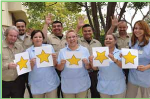
Our maintenance and housekeeping staff celebrate our award and the major role they play in keeping our Home so comfortable for the Residents.