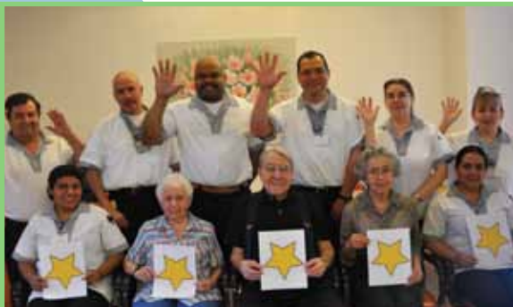
Three of our Residents (center bottom) who regularly volunteer in the kitchen/dining room join the kitchen staff in celebration of our five-star award.