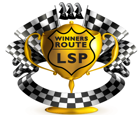
The Auxiliary Event will take place at the Toyota USA Automobile Museum in Torrance, CA. 6/23/12

Items for the Live and Silent Auction are still welcome. Vacations & Condos, Weekend Getaway, Air/Water Rides Food, Wine, Restaurants, Entertainment Theater/Movies/Concerts, Sports/Theme Parks Spa Days, Art and Jewelry Memorabilia, and more. If you can help, please call 310-548-0625.