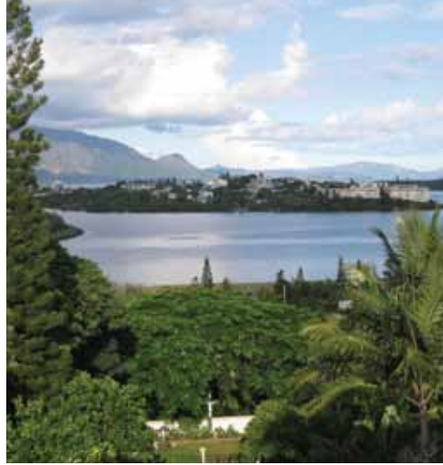
From the balcony of the Home you can view the garden and the beautiful crucifix. Beyond is the bay and city of Noumea.