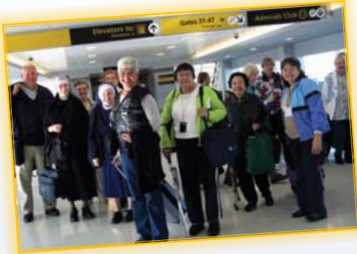
LAX - Bound for Rome