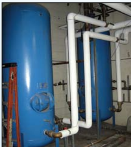
Above: two new water heaters. Below: two new hot water tanks.