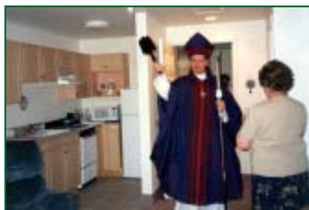
Top: Cardinal Mahony blesses the Community Room for the Independent Living Apartments.